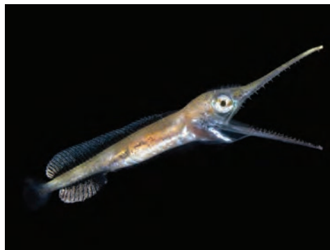
1 cm long larval Swordfish, Xiphias gladius

However, these stories are the exception and not the rule. Wild Oceans sees a pressing need to